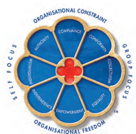
The Window on Work Values Model