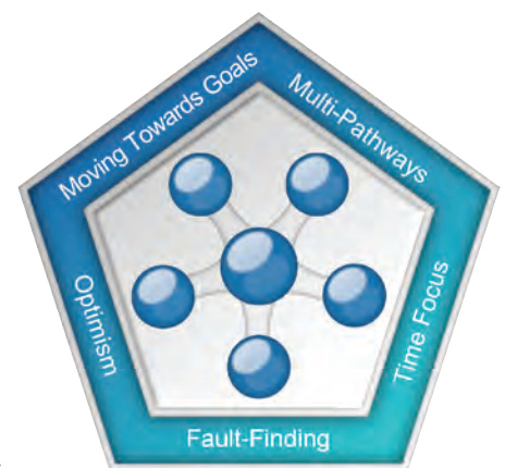
The QO 2 ® Model

Exploring these new perspectives helps you understand fears and motivations at work, creates significantly greater understanding of those around you and gives you a model for moving forward with a balanced view of the risks and potential rewards.