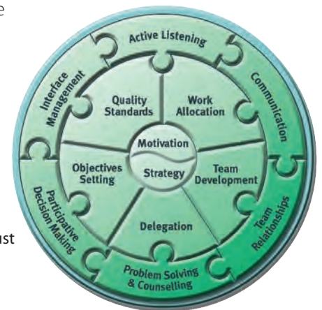
The Linking Skills Model